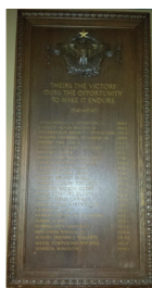
In Queen's Head Pub: "Their's the victory. Ours the opportunity to make it endure."