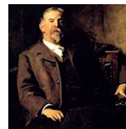
Henry Lee Higginson (1834–1919) by John Singer Sargent 35

Henry Lee Higginson is recognized for his earlier gift to the university—Soldier's Field. Although this tour stays on the Cambridge side of the river, the story of Major Higginson and Soldier's Field is worth telling. On April 18, 1861, Henry Lee Higginson volunteered for the Second Massachusetts Regiment of Infantry and later transferred to the First Massachusetts Cavalry. He fought at Antietam and Fredericksburg before being wounded at the battle of Aldie on June 17, 1863 when his horse was shot out from under him. He suffered a bullet wound in his lower back and a sabre cut across his face, which left a scar for life. Henry Lee Higginson survived the Civil