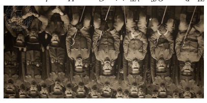
The Reserve Officers' Training Corps at Harvard on Memorial Day May 30, 1917. 53

While this tour must come to an end, there is more to discover about Harvard's military legacy. Additional plaques and memorials are scattered throughout Harvard's many campuses, athletic fields, dormitories and academic buildings. Thousands of other Harvard veterans have stories to tell. Each one is a testament to individual service and sacrifice. Together, they represent the collective strength of Harvard in support of the Nation during times of peace and war.