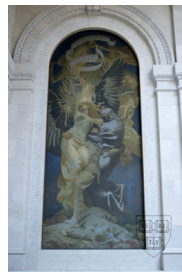
Death and Victory 27

Across Tercentenary Theatre from Memorial Church is Widener Library. Two murals painted by John Singer Sargent in 1922 to commemorate World War I hang in the main staircase of Widener Library. The inscription beneath "Death and Victory" reads: "Happy those who with a glowing faith in one embrace clasped death and victory." The inscription beneath "Entering the War," formerly titled "Coming of the Americans," reads: "They crossed the sea crusaders keen to help the nations battling in a righteous cause." Access to the library is restricted to the public.