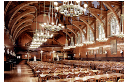
Annenberg Hall 18

A door on the right as you approach the building allows you to enter the transept of Memorial Hall. During the Civil War, one thousand three hundred and fifty-eight Harvard men fought for the Union and three hundred four for the Confederacy. When the war ended in 1865, alumni raised money to build a memorial for the Union dead. The names of one hundred and thirty-six Harvard men are inscribed on marble tablets on the walls of the transept. The building was completed in 1878 and includes Sanders Theater and Annenberg Hall, which is now used as the freshman dining facility. Access to both of these areas is restricted. There are more than twenty military memorials inside Annenberg Hall, including statues, portraits, stained glass, and battle flags. Downstairs in the basement on the wall of the Queen's Head Pub hangs a plaque bearing the names of twenty-five varsity athletes who were killed in World War II.