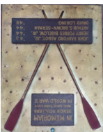
In Weld Boathouse