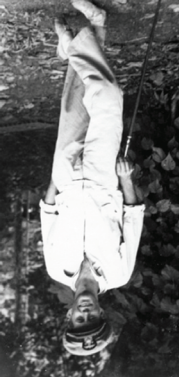
Lieutenant Junior Grade, John F. Kennedy. 50